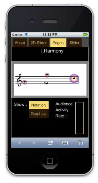
Figure 4: First movement of Saxophone Etudes

During the fall of 2011, we presented massMobile in a series of demos at Georgia Tech. During these demonstrations participants created music collaboratively through a tonematrix interface, selecting points on a grid to activate specific pitches at specific times (Figure 3). massMobile turned this classic sequencer paradigm into a collaborative improvisation as participants composed a constantly-changing loop together. There were no performers aside from the co-located participants using their mobile devices to interact with the shared tonematrix. Everyone could see the looping sequence projected on a screen and hear the result through a speaker