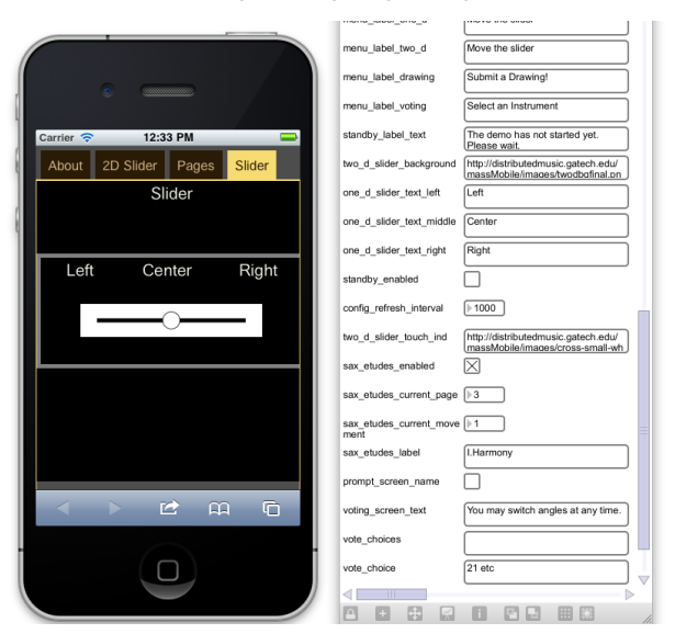
Figure 2: Left: User smartphone interface showing the slider model. Right: Configuration editor in Max/MSP API.

In the initial tests, audience members voted on lighting preferences. The votes were displayed on a video projection and also used to change the lighting configurations, which in