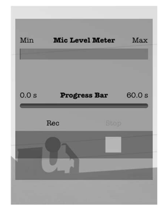
Figure 1. The UrbanRemix application for iOS enables users to record geo-tagged audio files and upload them to the server.

UrbanRemix enables anyone to record and share sounds using free applications we developed for Google's Android and Apple's iOS mobile devices (Figure 1) using their respective software development kits. Participants register for an account on the UrbanRemix website and agree to release all field recordings under a creative commons licence. They can then download the application to their phone and record short audio clips of up to 60 seconds (though in practice most are shorter). Each sound file is