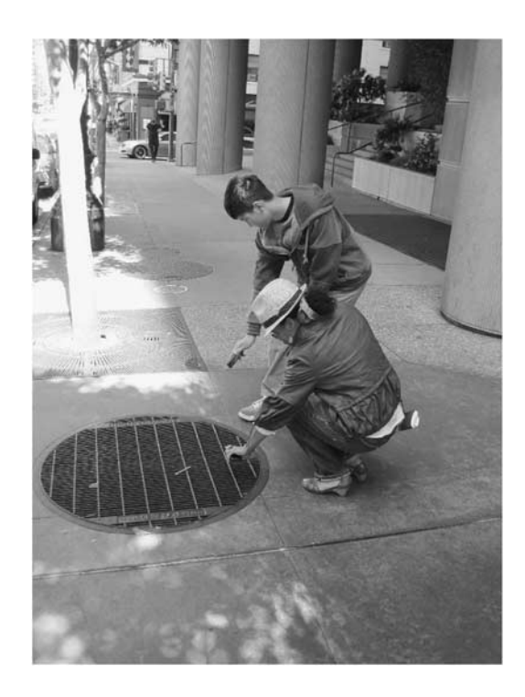
Figure 4. Participants in the UrbanRemix workshop at Glide Memorial Church recorded sounds in San Francisco's Tenderloin district.